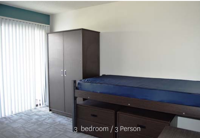
3 bedroom / 3 Person