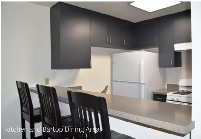
Kitchen and Bartop Dining Area